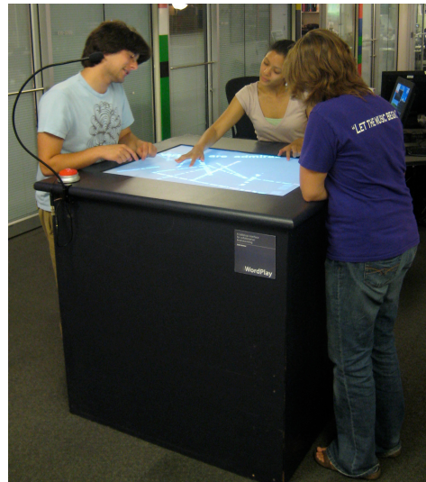
Figure 1. Participants at the WordPlay Table

Before a meeting, a facilitator prepares the table and chooses a background that corresponds the subject at hand. Participants gather at the table and contribute content by speaking into the microphone, or selecting a scalable, multi-touch keyboard. They can arrange ideas by sorting, expanding, and deleting them on the surface of the table. Throughout the session, any user can tap on ideas to request associations and suggestions from the system.