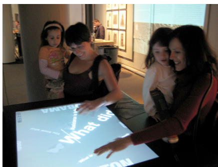
Figure 4. Users in a Museum

Presently, evaluations are based on usage over three months of lab demos, museum events, and our group's internal usage of the table. Some of the lessons we learned during usage are described below.